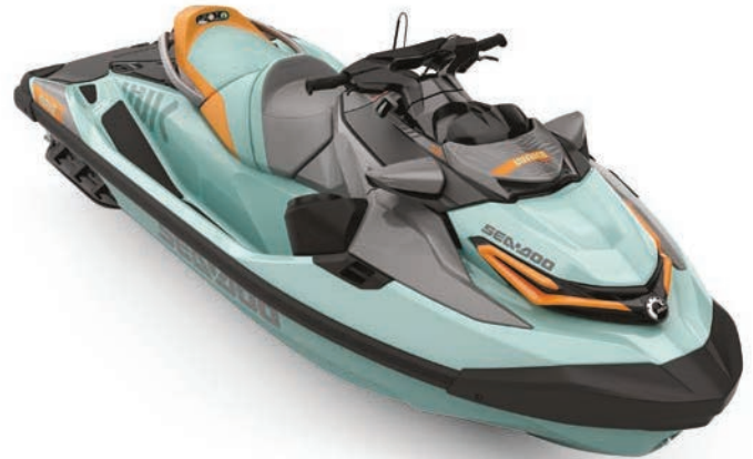
● Neo Mint