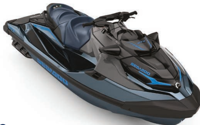
NEW Abyss Blue and Gulfstream Blue