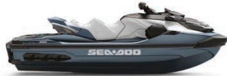
● Blue Abyss