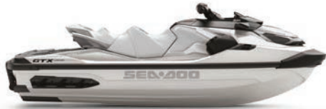
○ NEW White Pearl Premium