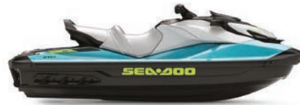
GTI™ SE 170