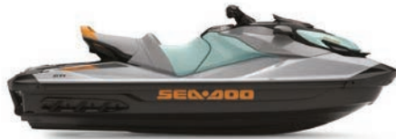
GTI™ SE 170