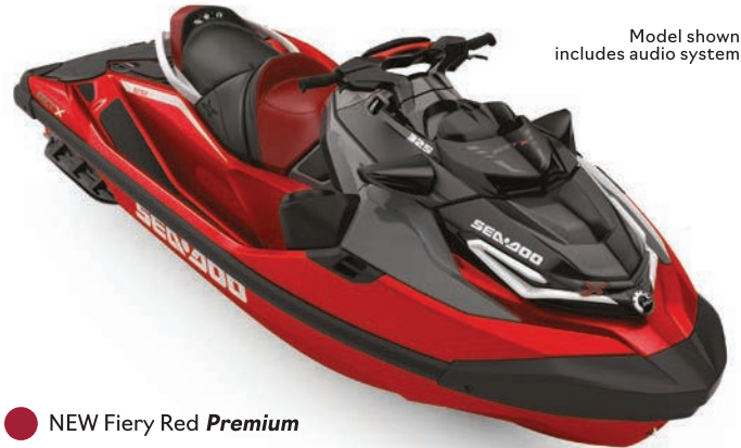
Model shown includes audio system