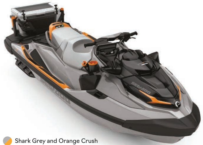
● Shark Grey and Orange Crush