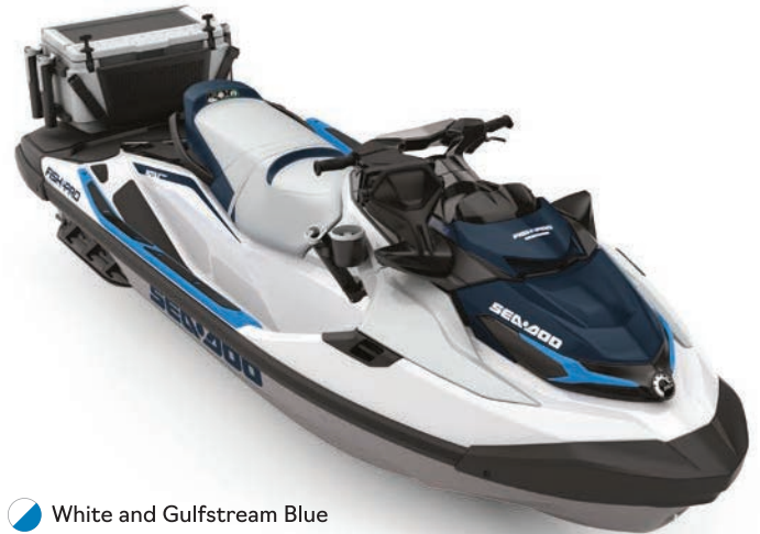
White and Gulfstream Blue